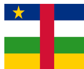
Central African Republic