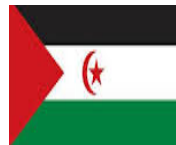
Western Sahara Republic