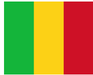
Mali (for 30 days)