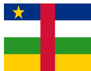
Central Africa Republic (CAR)