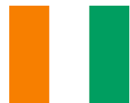
Cote d' Ivoire