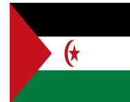
Sahara Arab Democratic Republic