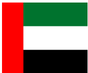
United Arab Emirates