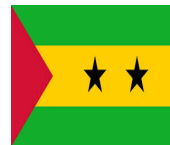
Sao Tome and Principe