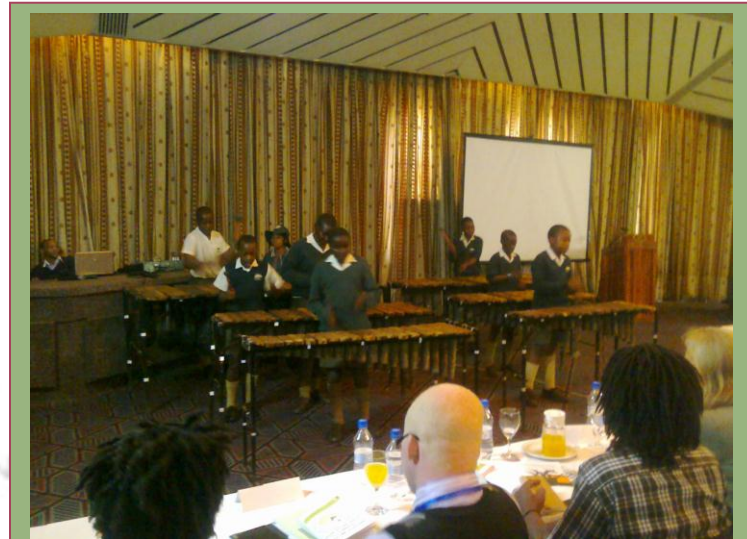
Masaisai Primary School Children Playing the Marimba instruments at the official opening of the congress